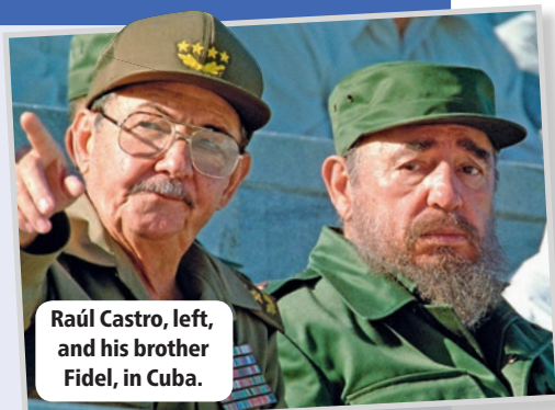
Raúl Castro, left, and his brother Fidel, in Cuba.

Cuba is a communist country. Raúl Castro is the current leader, but it was his brother and former leader, Fidel, who created a communist government. When Fidel came to power in 1959, he