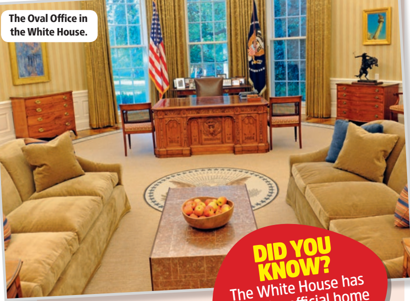
The Oval Office in the White House.

North Korea has a dictatorship. Since 1948, the country has been run by the Kim family; its current leader is Kim Jong-un. The country is very secretive, and visitors must be accompanied by official guides. The media (TV and newspapers, etc) is only allowed to report things that make the government look good. Reporters from other countries are not welcome. It is thought that around 25 million North Koreans live in severe poverty.