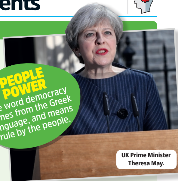
UK Prime Minister Theresa May.

PEOPLE POWER The word democracy comes from the Greek language, and means rule by the people.